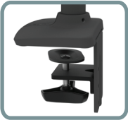
INCLUDED: STANDARD 2-PIECE DESK CLAMP ATTACHES TO SURFACE EDGE