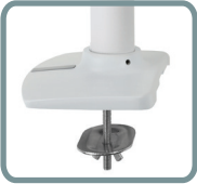
GROMMET MOUNT KIT ACCESSORY 98-034: ATTACHES THROUGH SURFACE HOLE