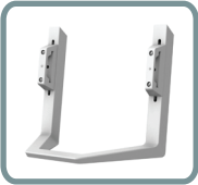
RECOMMENDED ACCESSORY: LX DUAL DIRECT HANDLE KIT 98-037-062 WHITE 98-037-224 MATTE BLACK